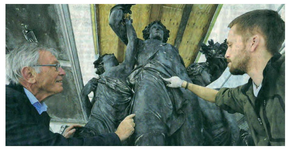
Our chairman (left) viewing the restoration of Schilling's sculpture "Noon" in Chemnitz