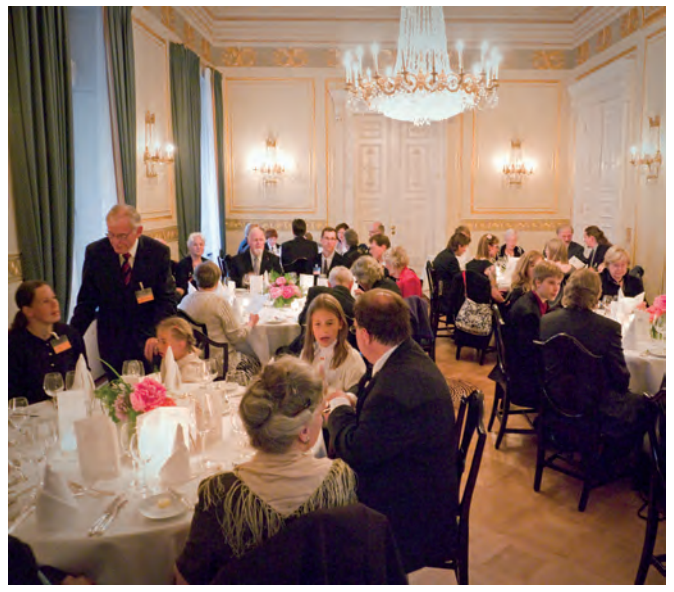
Many children and adolescents attendet the reunion

mains were among them." The service was accompanied by wonderful organ music.