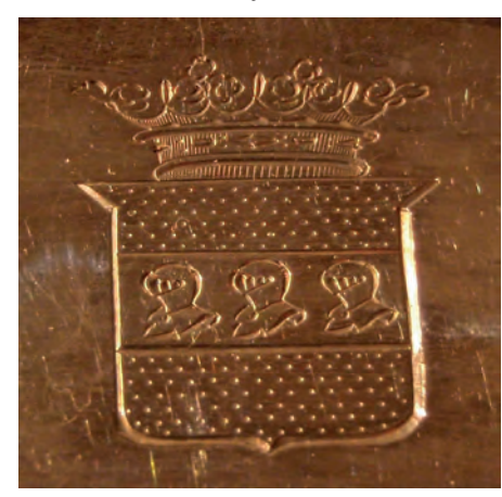
Coat of arms

ther Bodo (1893-1942) with five children. Four of them are living in Canada. Kurt, one of them, has meanwhile bought the plate.