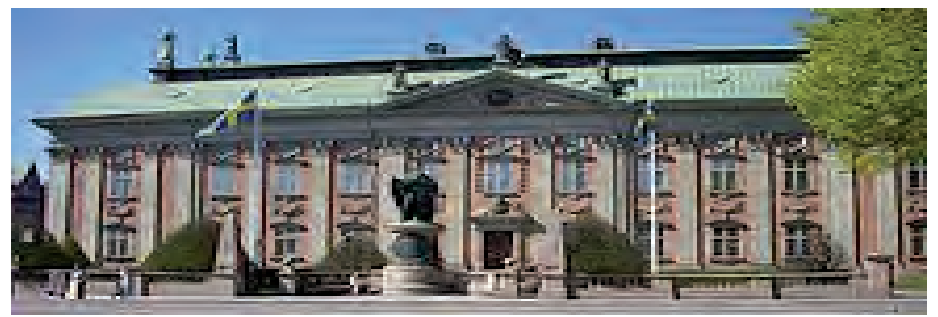
The House of Nobility in Stockholm

Information on details will follow. In case you are interested in coming it is advisable to start looking for reasonable flights soon.