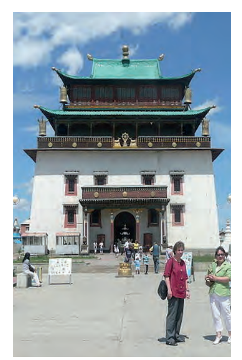
Gandan Monastery, central Sanctuary of Mongolia

This report is based on an Internet document coming from the Niedersächsische Staats- und Universitätsbibliothek Göttingen, 2007