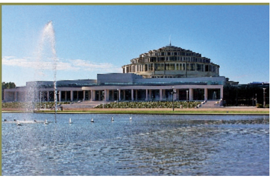
The monumental Centennial Hall, built in 1924