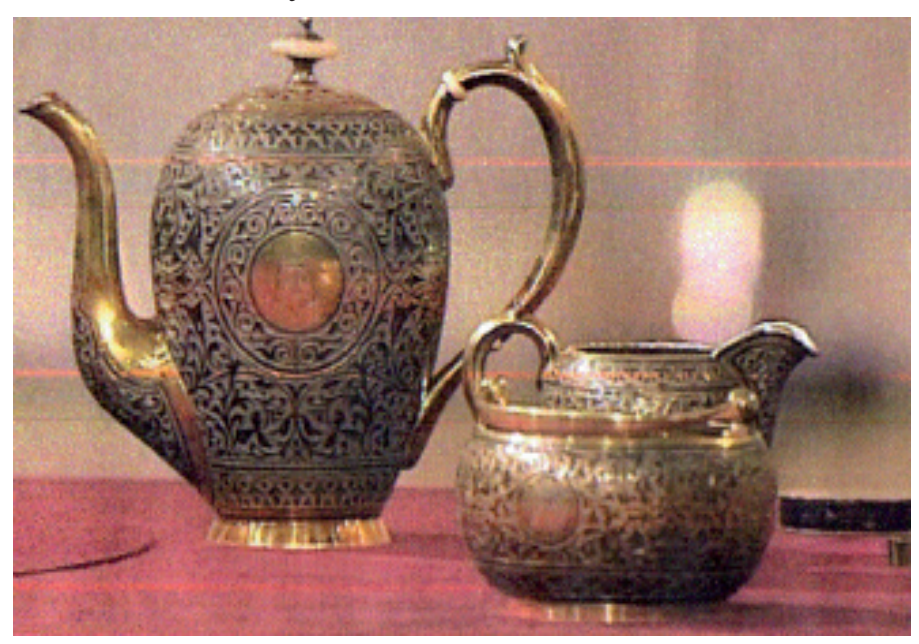
The silver tea set

A new family member discovered in a TV show