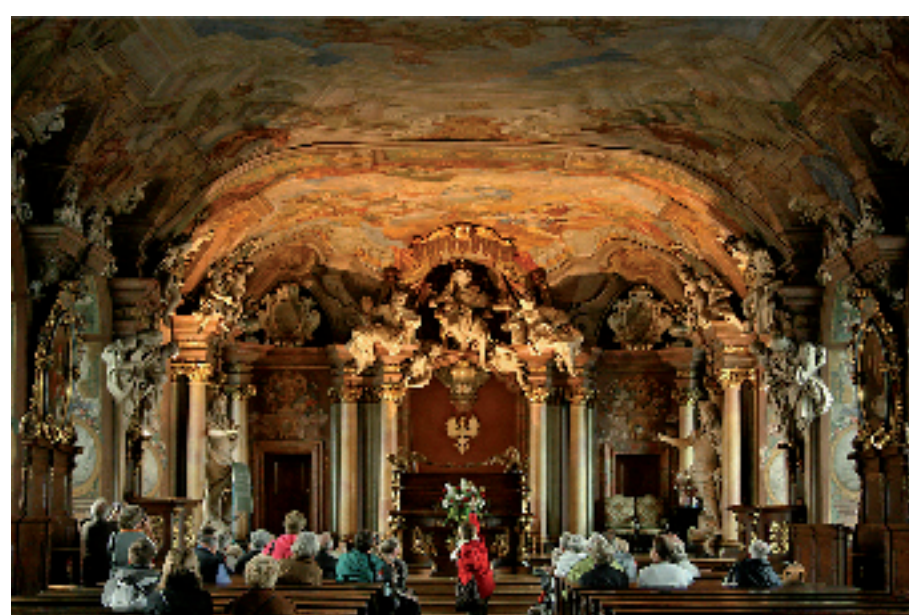
The beautiful "Aula" of the University of Breslau