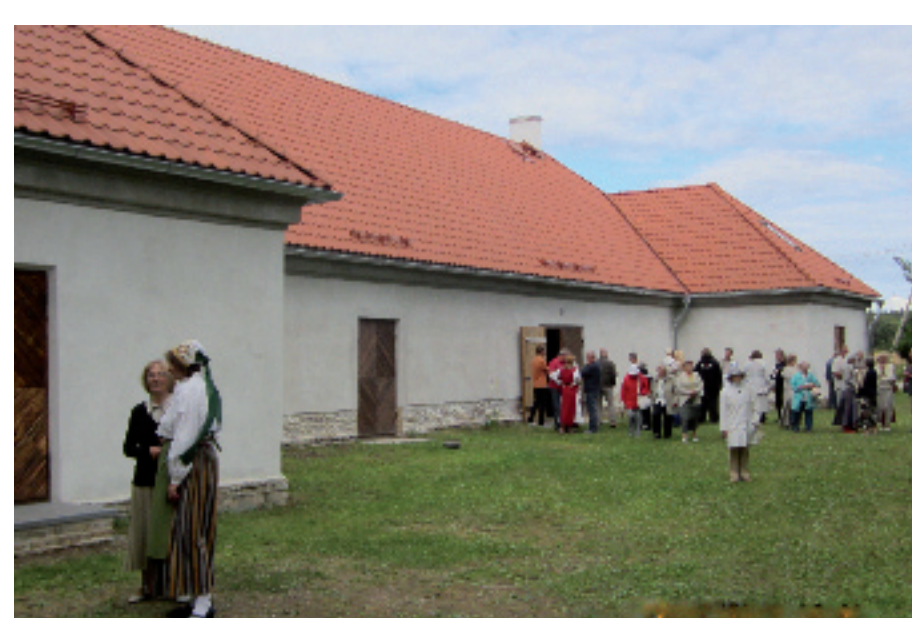
The restored granary on the opening day