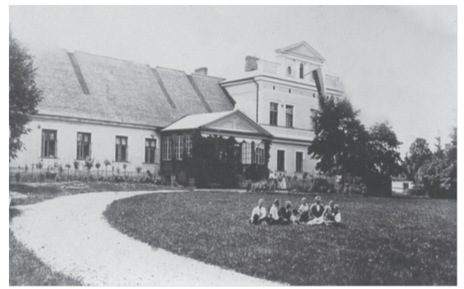
Seinigal Manor, ca. 1900. The manor house was destroyed by Soviet soldiers before the German invasion in 1941. Today there are only ruins left.

The oldest find, a simple stone axe from the Stone Age (8000 – 1800 BC), came from Kahal Village. The numerous stone settings (barrows composed out of stones of different size) are testimonies of the Bronze Age (1800 – 500 BC). During the