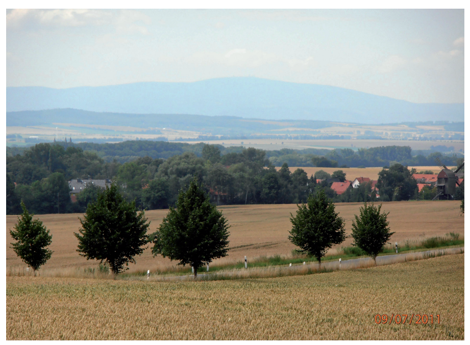
View of the field "Unter dem Schilling" in the Magdeburg Börde with the Brocken, the highest mountain in the Harz, in the background.