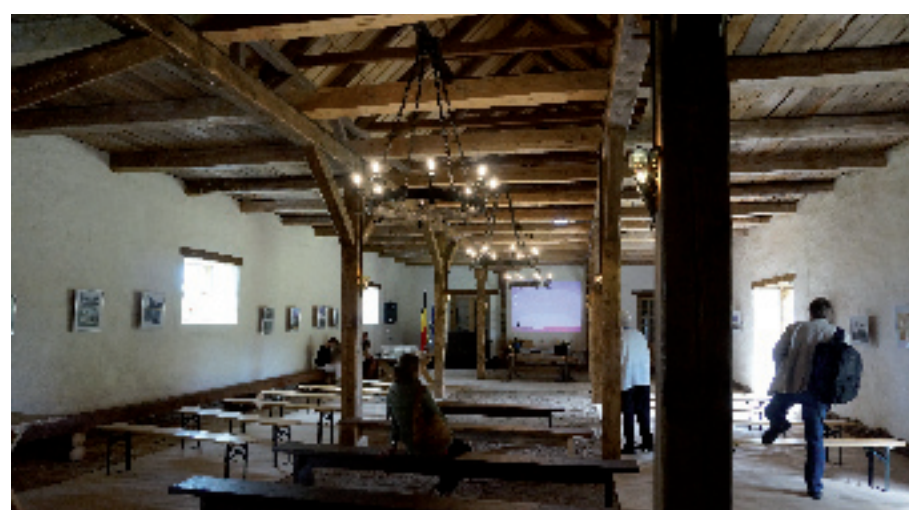
The restored granary on the opening day

In appreciation for fighting against the Soviets in the Estonian Liberation War (1918-1920) part of the estate was granted to an Estonian by the government. After the Soviet occupation in 1940 he was expelled, too. When Estonia had regained independence in 1991, however, the family of his granddaughter was given the estate back. The granddaughter attended the celebration,