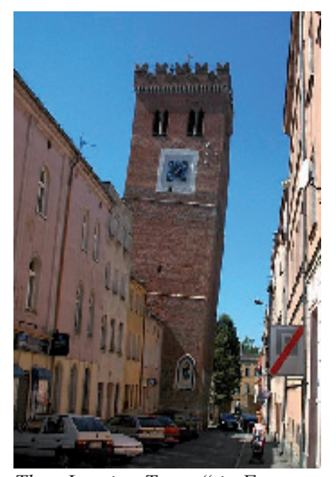
The "Lesning Tower" in Frankenstein, 15. th century

On the next day our tourism programme will start with a bus trip