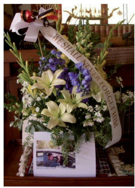
The bouquet of flowers given by the family association