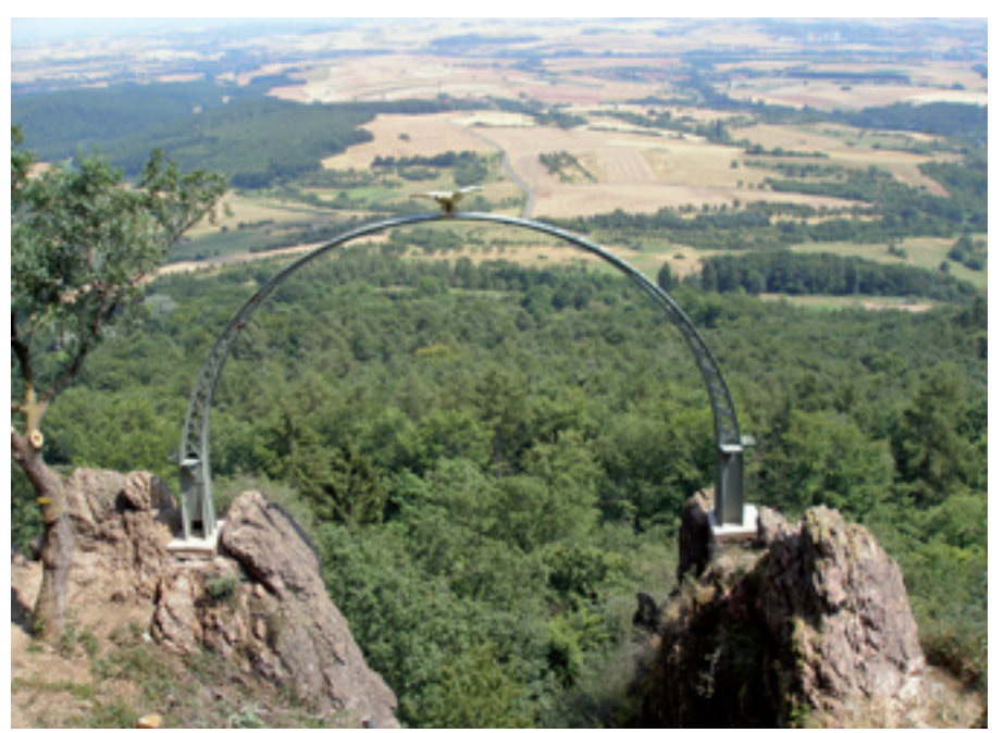
The eagle arch after restoration