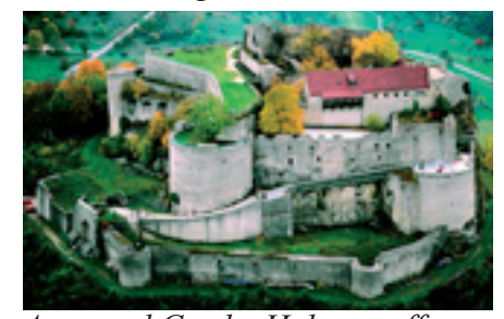
Ancestral Castle, Hohenneuffen

The reunion will end on Wednesday morning (21 June). The exact schedule will be published in our next Schilling Courier.