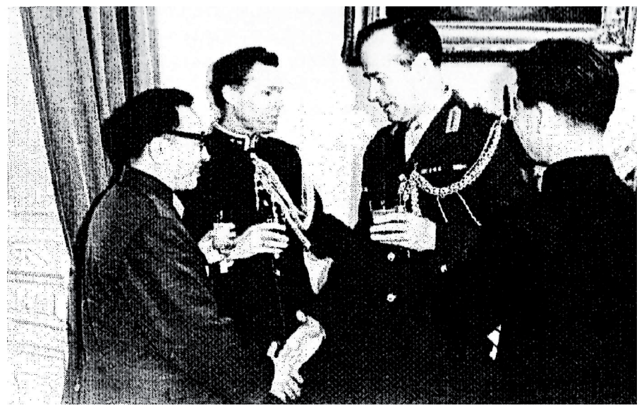
Donald welcomes a Chinese delegation

by militia men who keep a constant eye on traffic. It is amusing to watch them when they see our diplomatic white number plate, for they pause, then rush inside to telephone the next chap down the road that the foreigners are on their way! ... There is no chance of leaving the main road, for not only do we have KGB surveillance cars on our trail, but also these policemen would soon be after us."