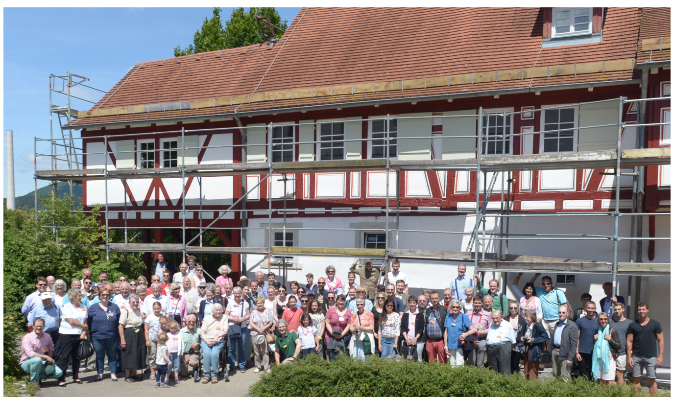
The participants of the family reunion in front of the "Schilling Schlössle" which is undergoing renovation

Participants from eight countries at the 19th family reunion in Köngen near Stuttgart