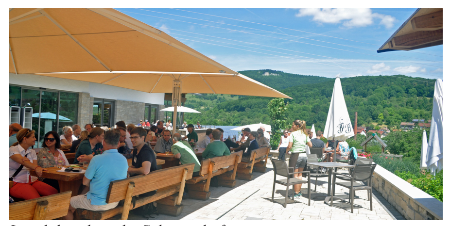
Lunch break at the Schützenhof restaurant