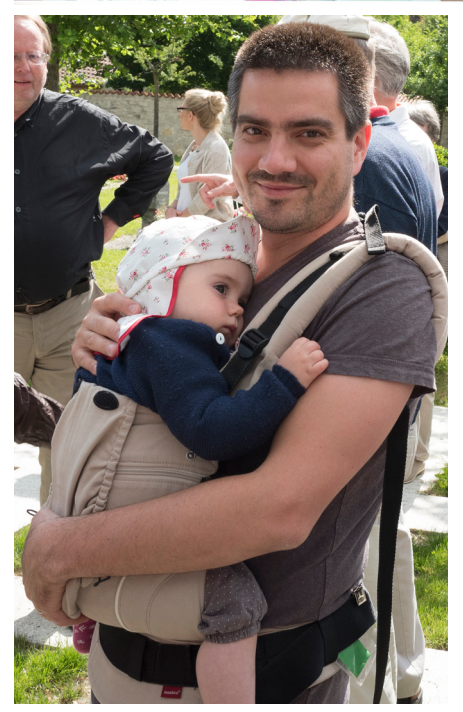
The youngest, 10 months old