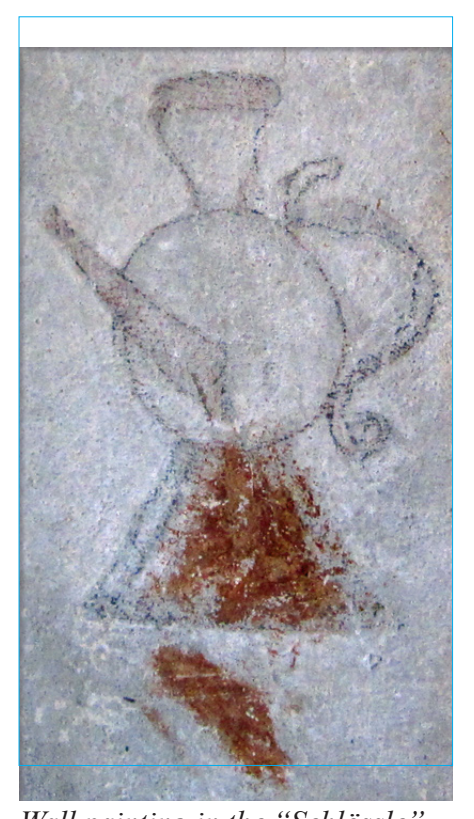
Wall painting in the "Schlössle"

The next stop was Oberlenningen where three employees of the municipa-