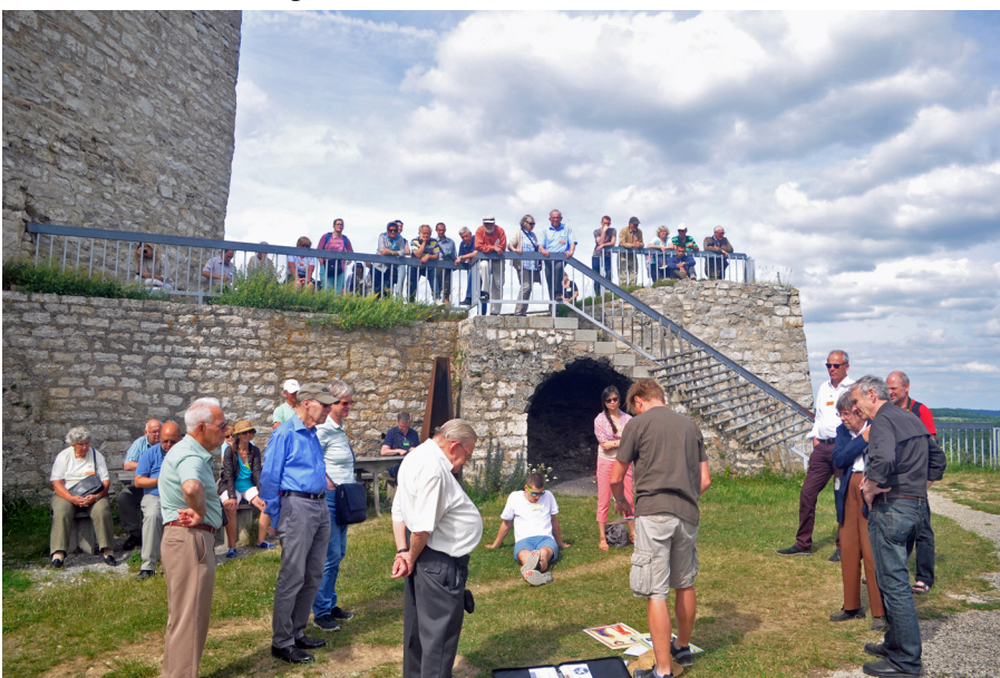
Visitors looking at maps at Hohenneuffen Castle