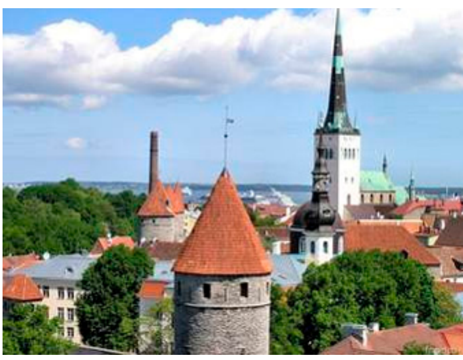
View of Tallinn/Reval from the Cathedral Hill

Once again, we want to organise next year's reunion of the eastern branch in our former homeland Estonia. We will meet from Friday 27 July till Monday 30 July, 2018, optionally the reunion will end in Riga/Latvia on 1 August.