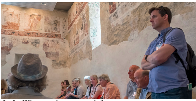
Left: When is dinner ready? Right: In St. Bernard's Chapel