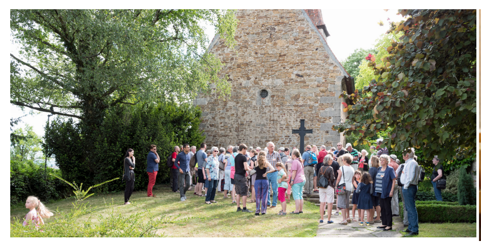
In front of "Zu Unserer Lieben Frau im Hürnholz" Chapel