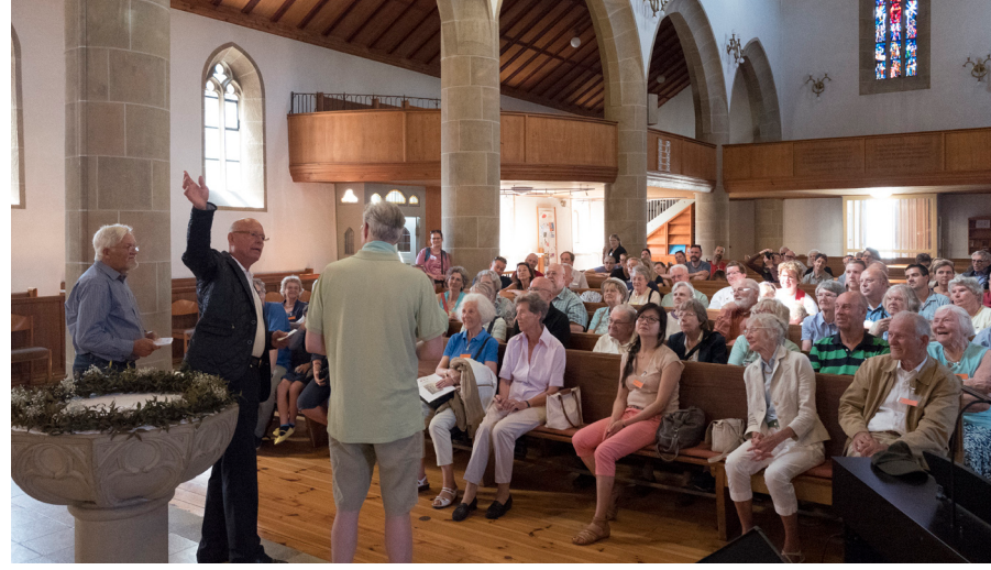
The Deputy mayor of Neuffen welcoming the visitors of St. Martin's Church