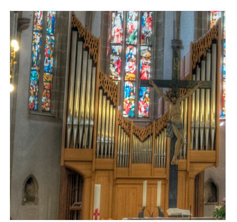
The organ of St. Martin's