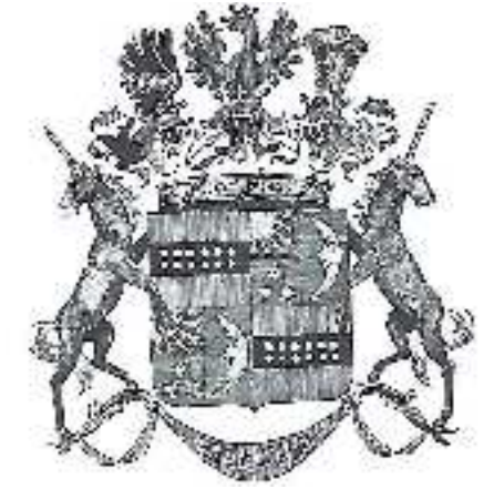
Wappen Schilling Kallikül

chancellor, he was mayor of Cologne. Obviously, he enjoyed collecting paintings of famous citizens of Cologne in his house.