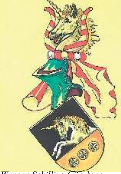
Wappen Schilling Günzburg