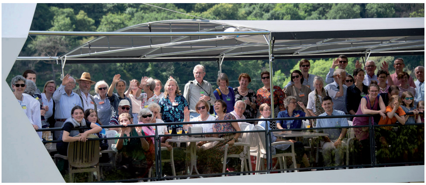
Family reunion on the sightseeing boat "Deutsches Eck"

After visiting Lahneck Castle, wonderful trip on the Rhine