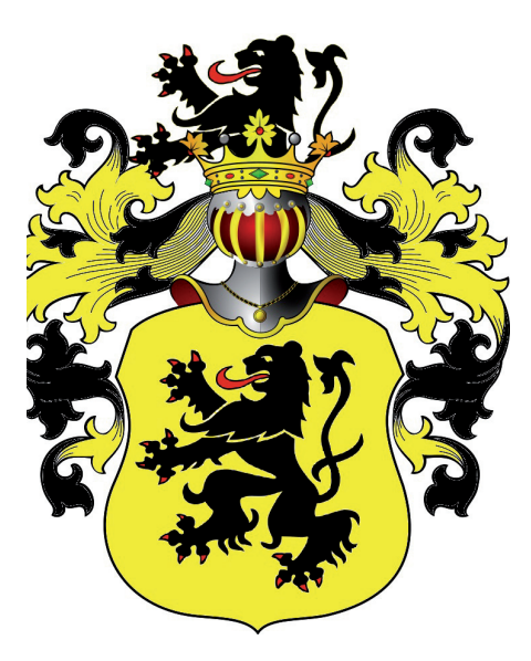
Coat of arms of the Freiberg Schillings

The lion coat of arms is valuable evidence of the genealogical connection of these Schilling lines, which had already separated after 1400. The coat of arms is therefore likely to be very old, but can only be proven with certainty with the above legal dispute at the earliest. On the other hand, the coat of arms of the related Kleckewitz line is known since the 15th century, a bandage shield, occupied by twelve balls, a speaking coat of arms, since the number twelve called "Schilling" was also