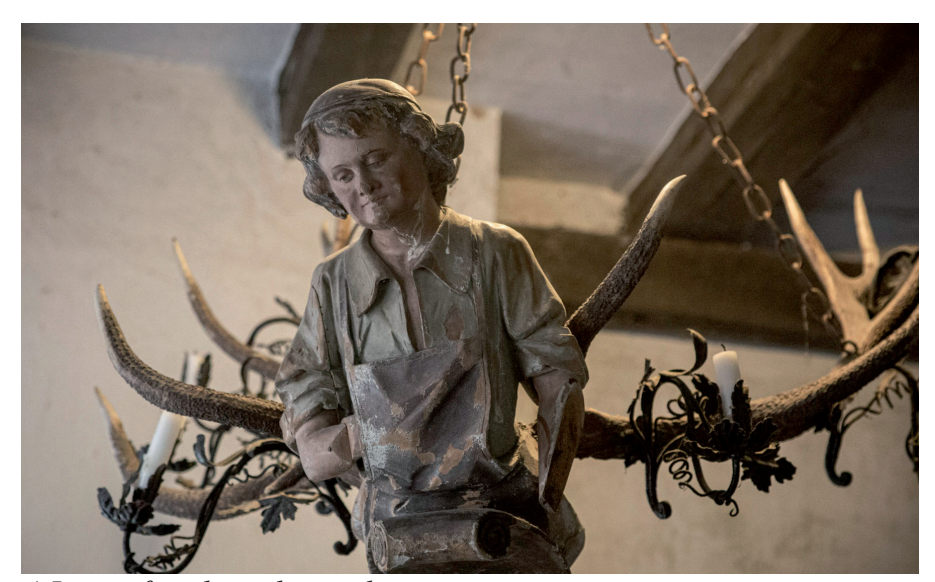
A Lüster female in the castle